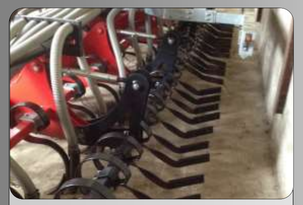
Golf clubs & double depth wheels As an lighter alternative to the flat bar roller, the Fieldmaster can be equipped with golf clubs and double depth wheels.